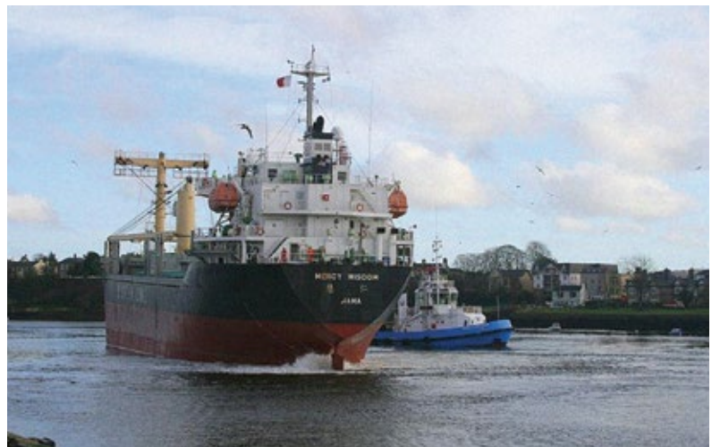
Lisheen cargo leaves the Port of Cork

The road system currently caters for up to 60 truck loads of material a day, travelling to the port at Cork Harbour – the second largest natural harbour in the world. Lisheen has an established logistics operation which includes chartering its own marine vessels from Cork.