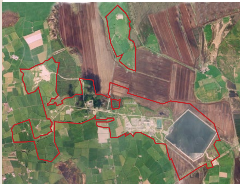
Satellite image of the 1,125 acre (455 hectare) Lisheen site landbank