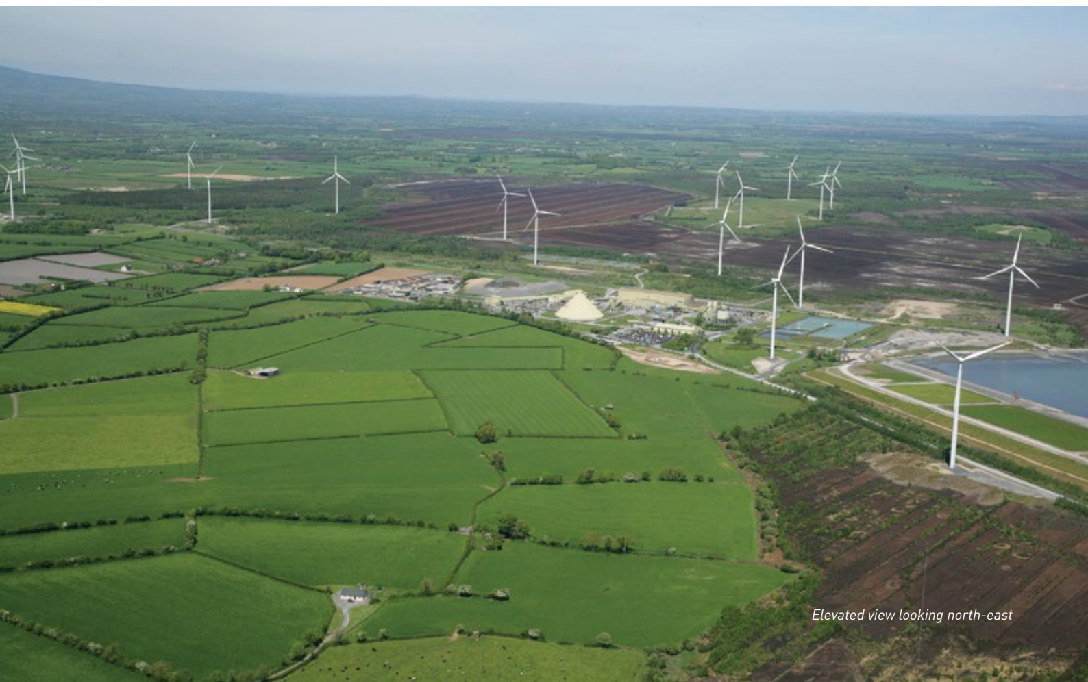
Elevated view looking north-east