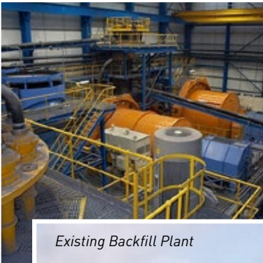
Existing Backfill Plant