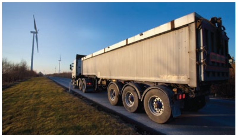
Ore concentrate truck