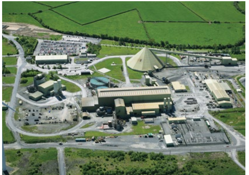
Aerial view of site looking south

The Lisheen site boasts an excellent track record in project planning and development. The site has successfully progressed five planning applications since its establishment. Lisheen wind farm, for example, was granted full planning consent in just 14 months.