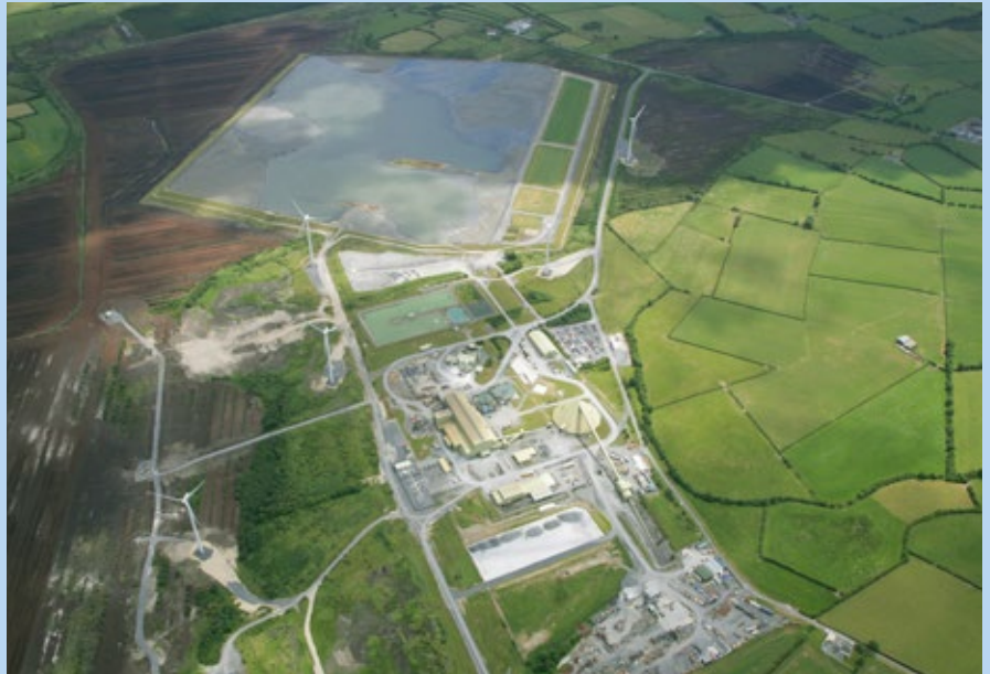
Existing Milling Plant