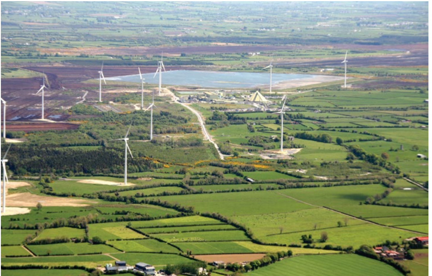
"a low population density rural setting". Elevated view of the existing site looking east