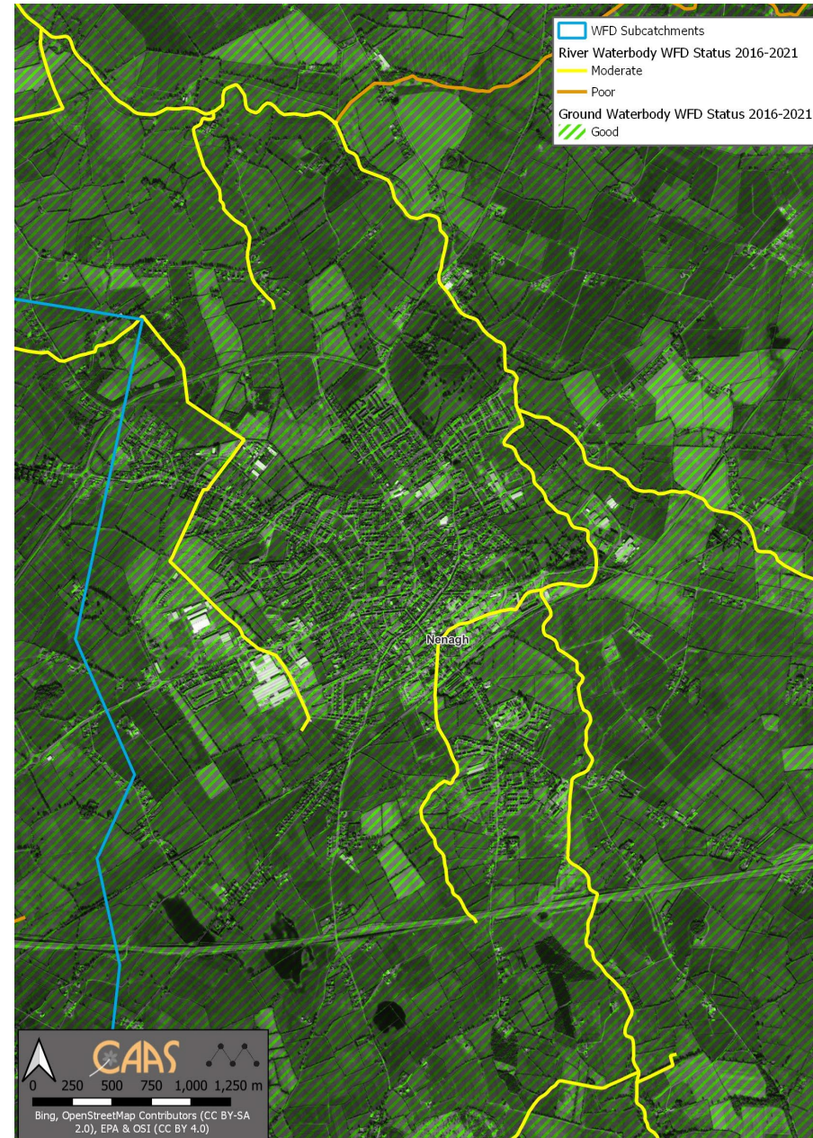
WFD Surface Waterbodies and WFD Ground Waterbodies Status (2016-2021)