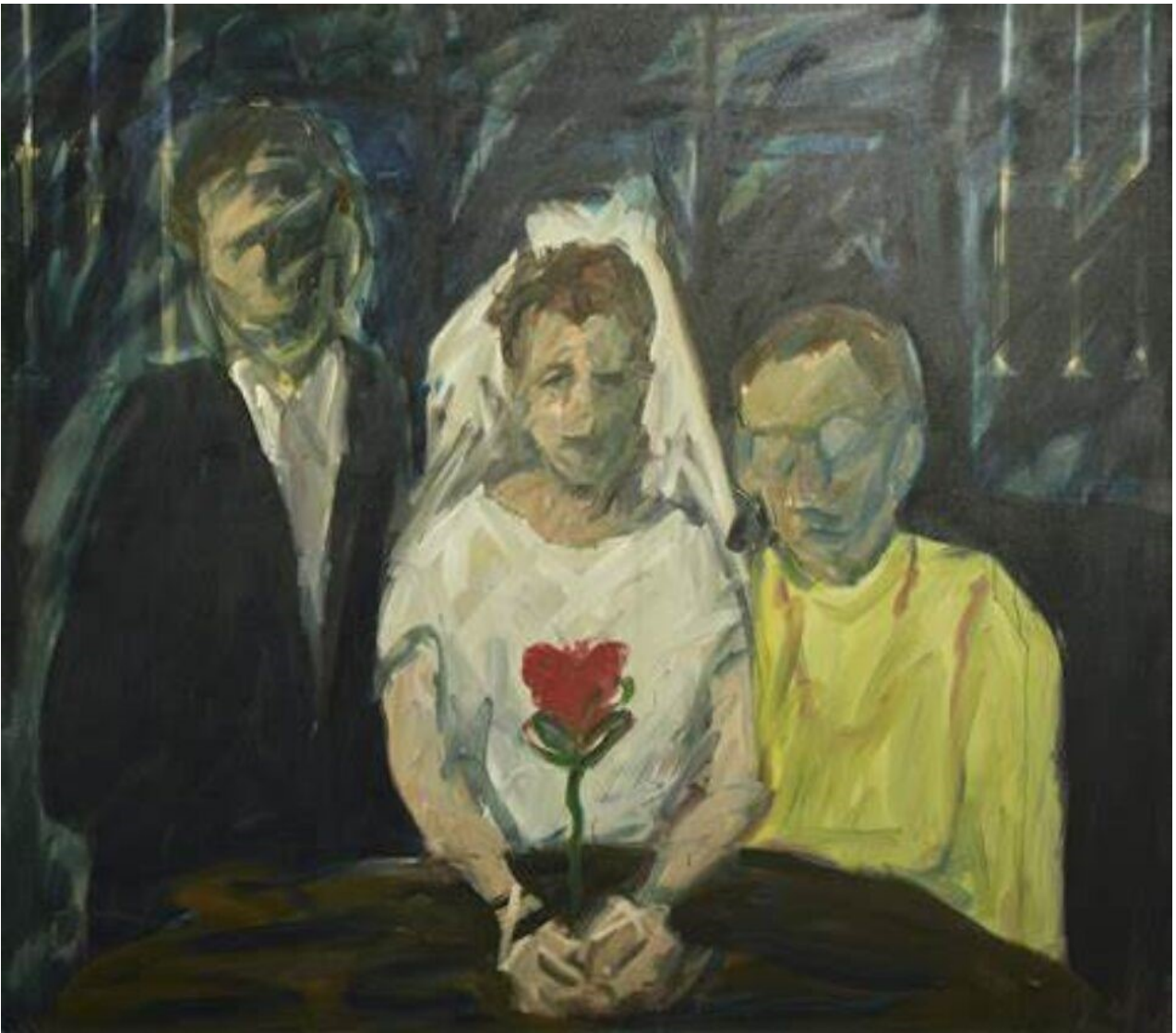
Image credit: 'Act of Union (Once Upon a Time)', 1986 Unframed: 152 h, 182 w cm/ Oil on canvas / IMMA Collection

Taking place in the Source Arts Centre, Thurles on Tuesday 11th June this stimulating and fascinating event will see the two highly regarded Tipperary-based artists exploring a range of topics that have informed and inspired each of their practices.