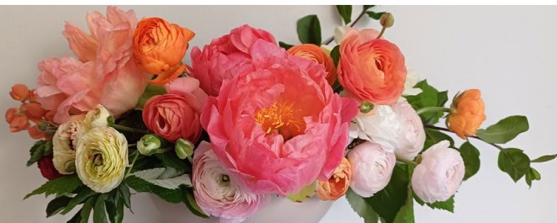
Hand-tied bouquet with Roisin O'Connell